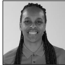
Teresa Weatherspoon Assistant Coach