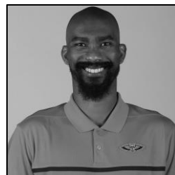
Corey Brewer Assistant/Player Development Coach