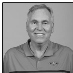
Mike D'Antoni Coaching Advisor