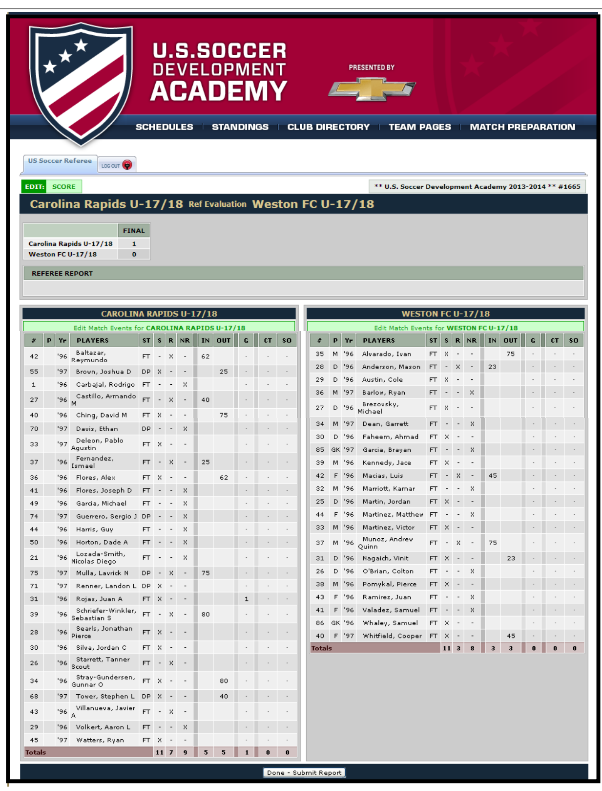
IMAGE: Match Report - Step #4, Confirm Game Data and Submit Report