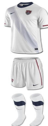
IMAGE: Sample Development Academy Uniform Schedule (when applicable)