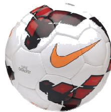
IMAGE: Development Academy Nike Game Ball