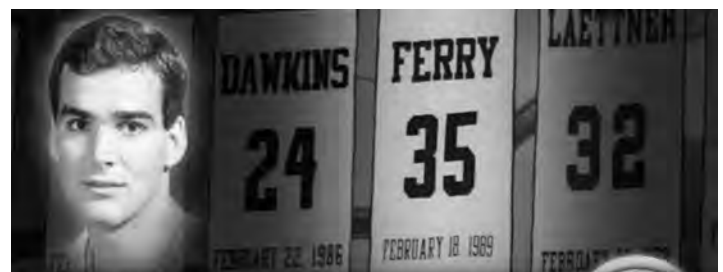
Danny Ferry 35 6-10 • 230 • Bowie, Md. • Political Science Major