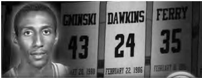
Johnny Dawkins 24 6-2 • 165 • Washington, D.C. • Political Science Major