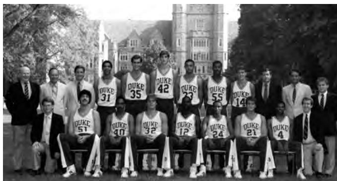
In 1986, Duke finished atop the final national Associated Press poll after winning 37 games and reaching the NCAA championship game.