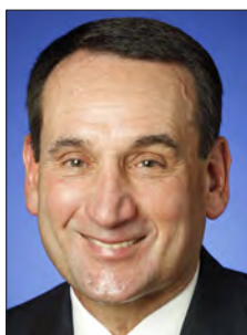
MIKE KRZYZEWSKI Head Coach Army West Point '69 42nd Season at Duke 47th Season Overall