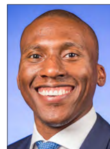
NOLAN SMITH Assistant Coach Duke '11 7th Season at Duke