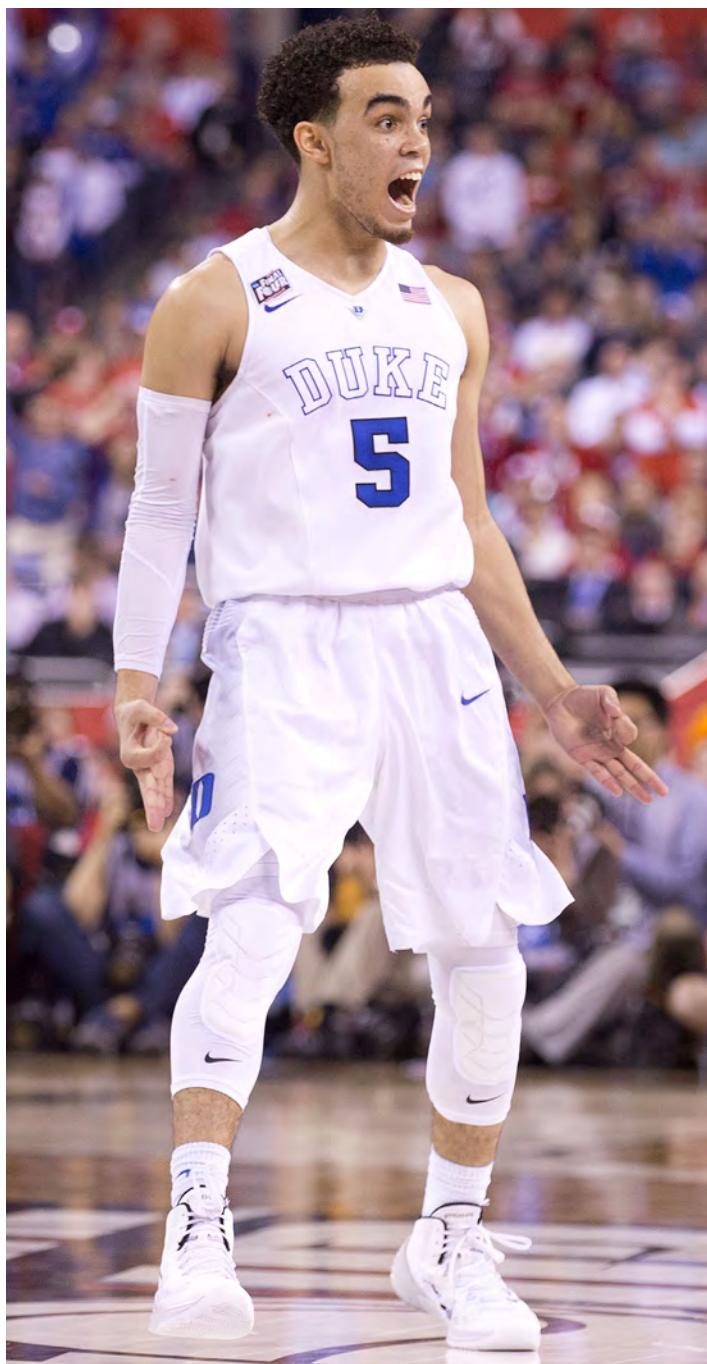
Tyus Jones earned Final Four Most Outstanding Player honors in 2015 after scoring a game-high 23 points in the championship game.

The 2020 NCAA Tournament was canceled due to the COVID-19 pandemic