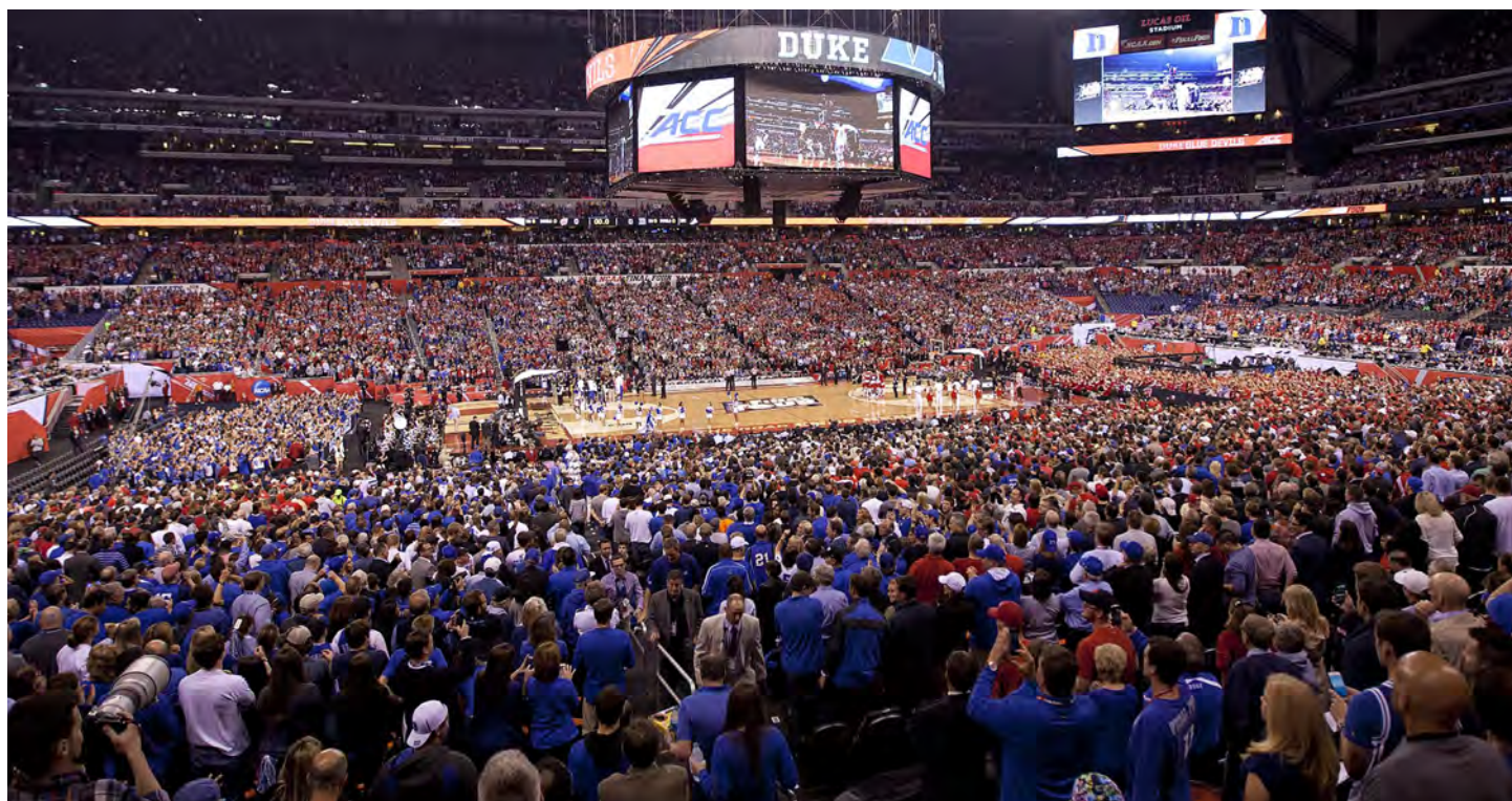
Duke defeated Wisconsin in the 2015 National Championship at Lucas Oil Stadium before a crowd of 71,149.