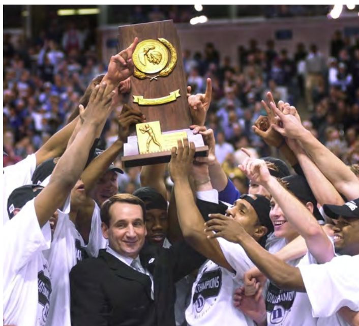
The Blue Devils were ranked No. 1 in the final national Associated Press poll in 2001. Duke went on to defeat Arizona in the NCAA championship game.