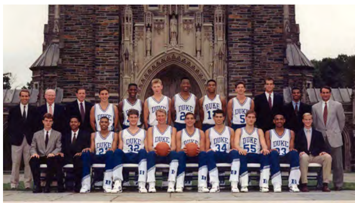
In 1992, Duke captured the school's second national championship and was ranked No. 1 in the final national Associated Press poll.