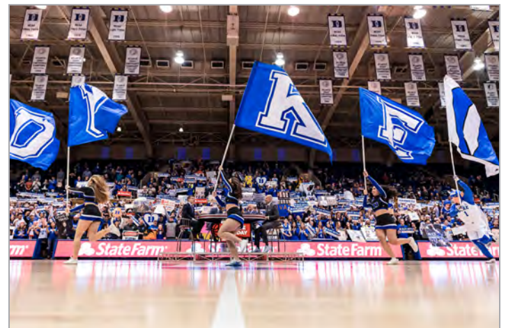
ESPN College GameDay for Duke vs. Virginia on January 19, 2019.