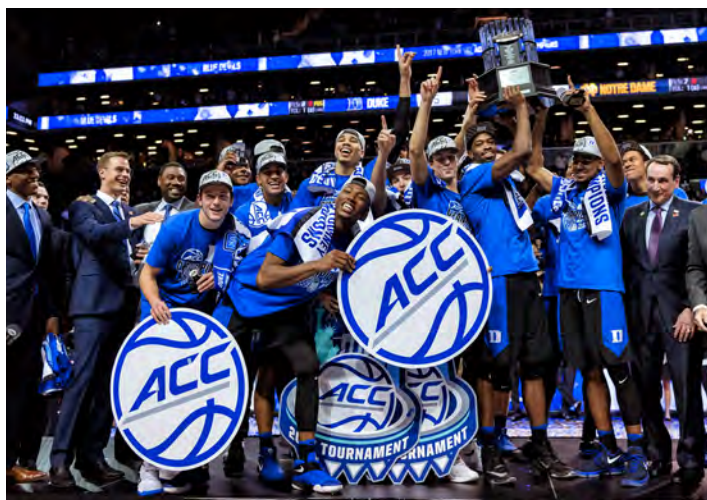
On March 8-11, 2017, in Brooklyn, N.Y., Duke became the first team in league history to win four games in four days to capture the ACC Tournament championship.