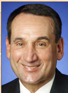
MIKE KRZYZEWSKI Head Coach Army West Point '69 42nd Season at Duke 47th Season Overall