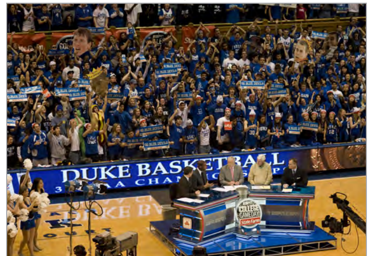
ESPN College GameDay for Duke vs. North Carolina on March 6, 2010.