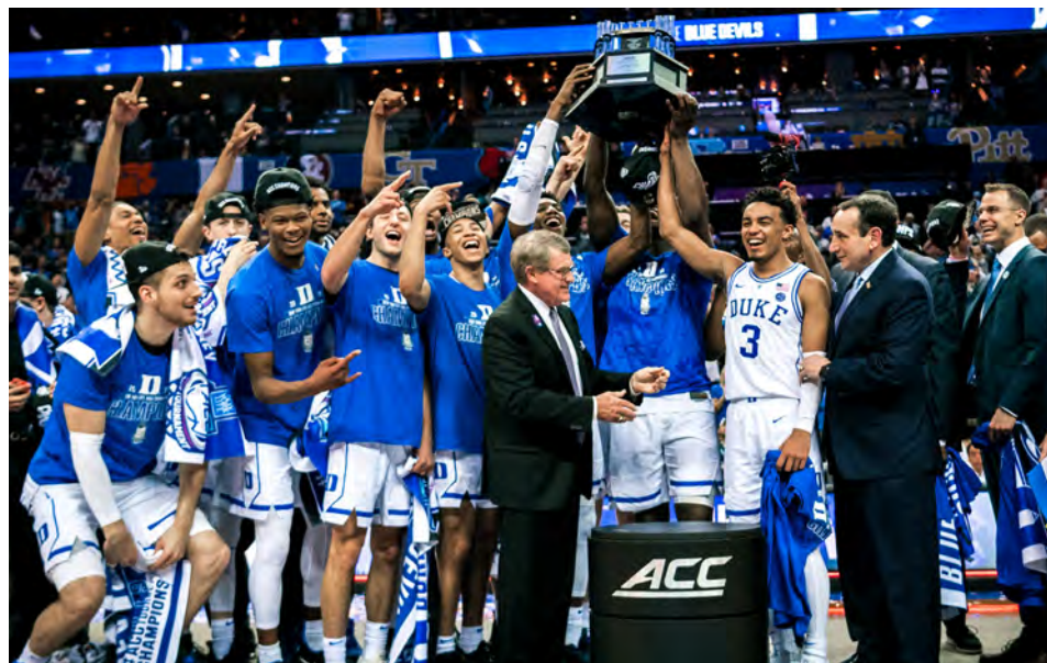
The 2019 Blue Devils, who captured the program's 21st ACC Championship, went wire-to-wire in the Associated Press top 5.