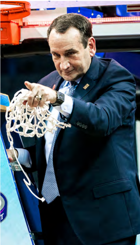
Mike Krzyzewski is the career victories leader in college basketball history.