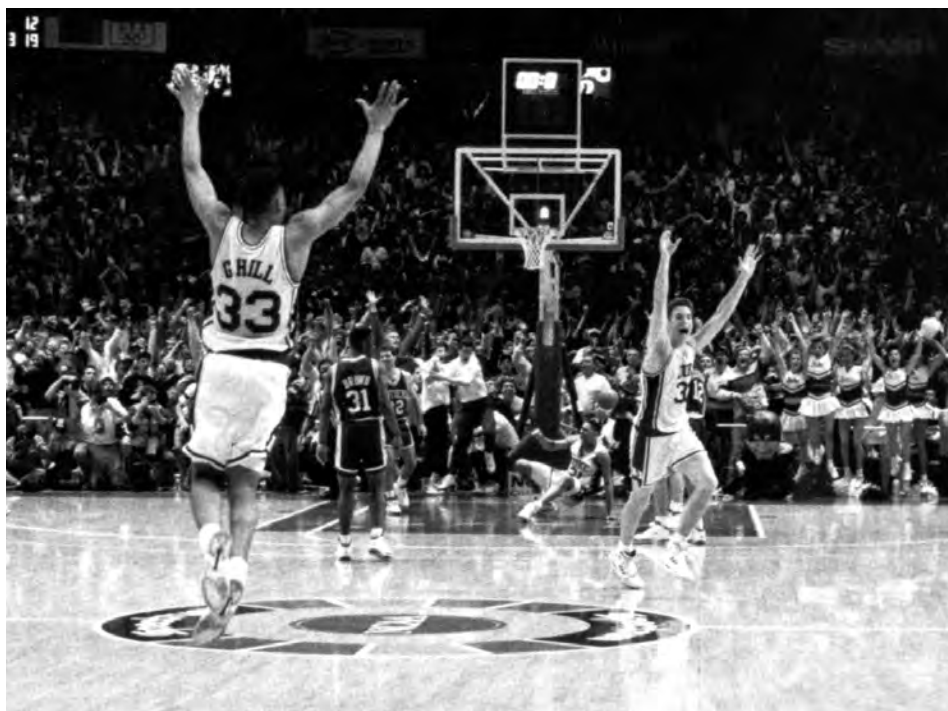
Christian Laettner's game-winner at the buzzer versus Kentucky propelled Duke to the Final Four in 1992. It became known in college basketball circles as "The Shot."