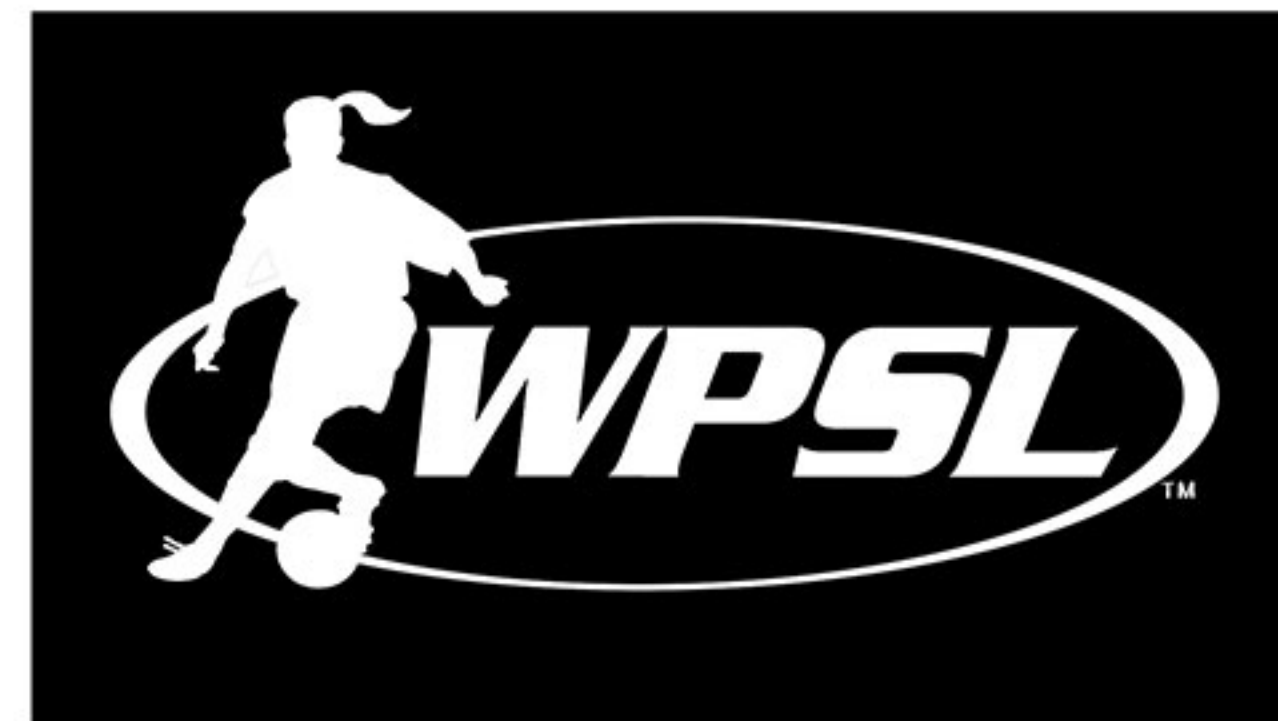
PRIMARY | NEGATIVE