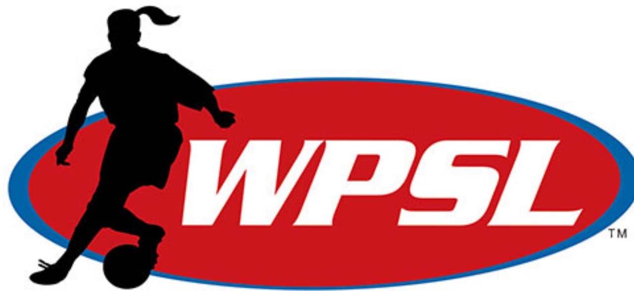
PRIMARY | FULL COLOR

The integrity of the WPSL identity is upheld by the consistency of the accurate usage of WPSL Logos, Colorways, and Wordmarks.