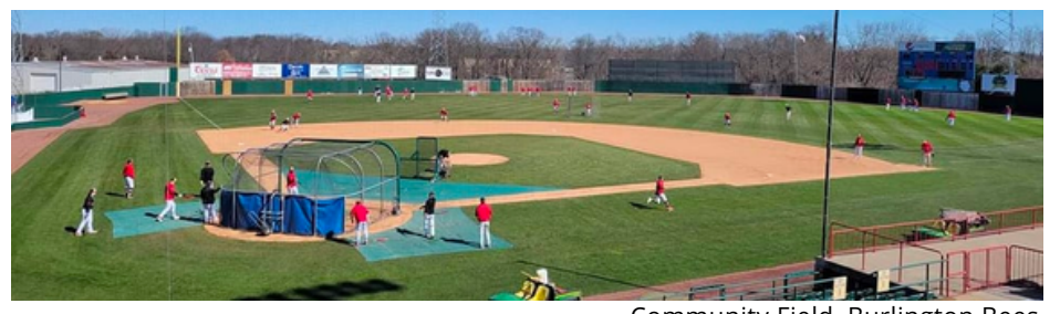
Community Field, Burlington Bees