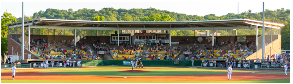
VA Memorial Stadium, Chillicothe Paints