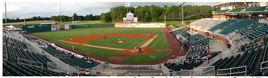
Jackson Baseball Stadium, Jackson Rockabillys