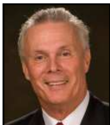
Bo Ryan Head Coach 15th season at UW