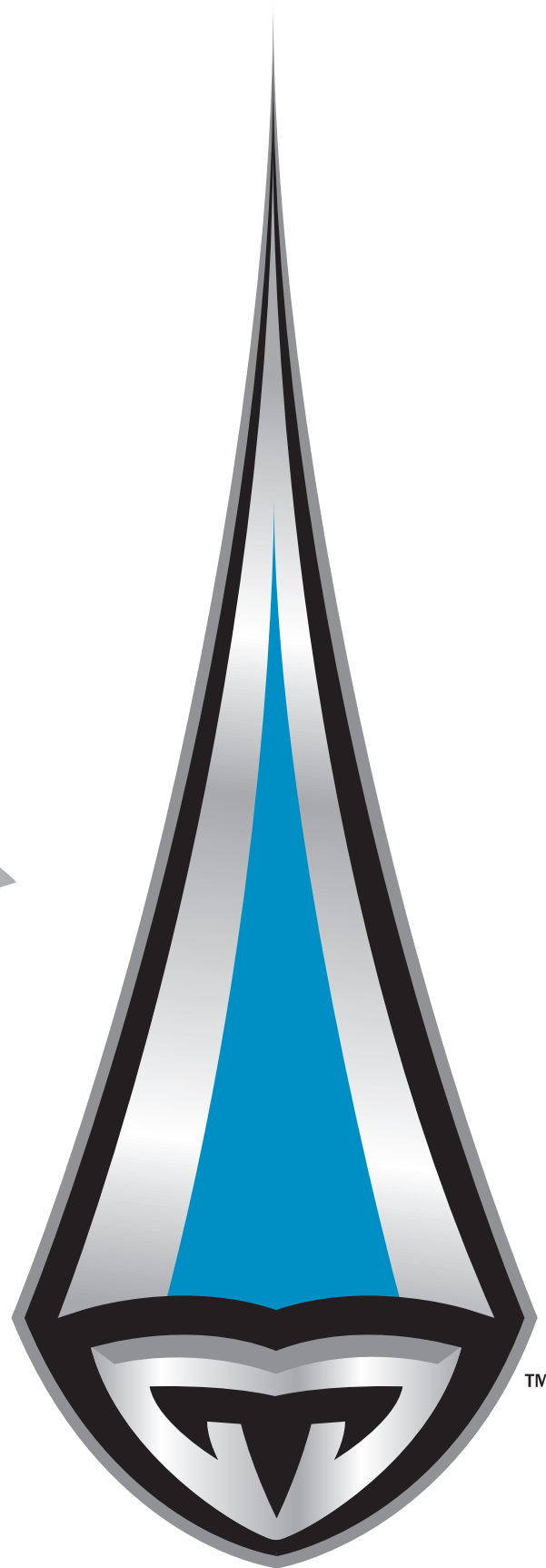
SUPPORTING MARK 1