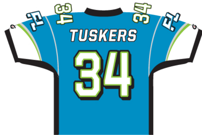
Home Jersey: Back