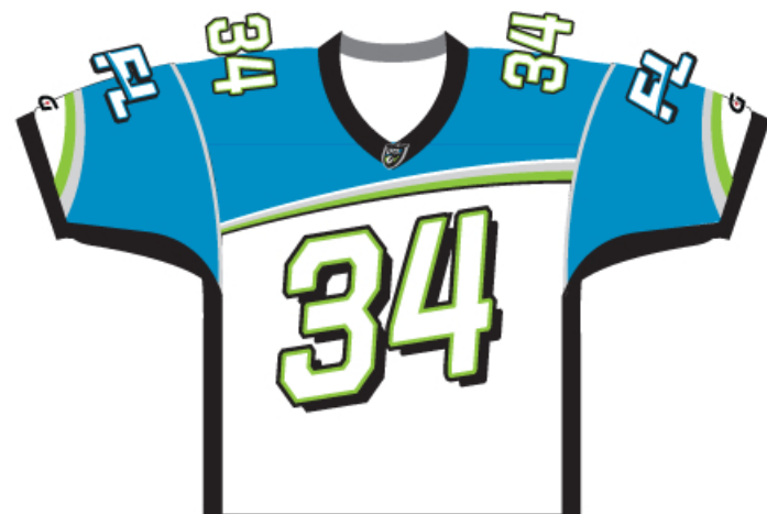
Away Jersey: Front