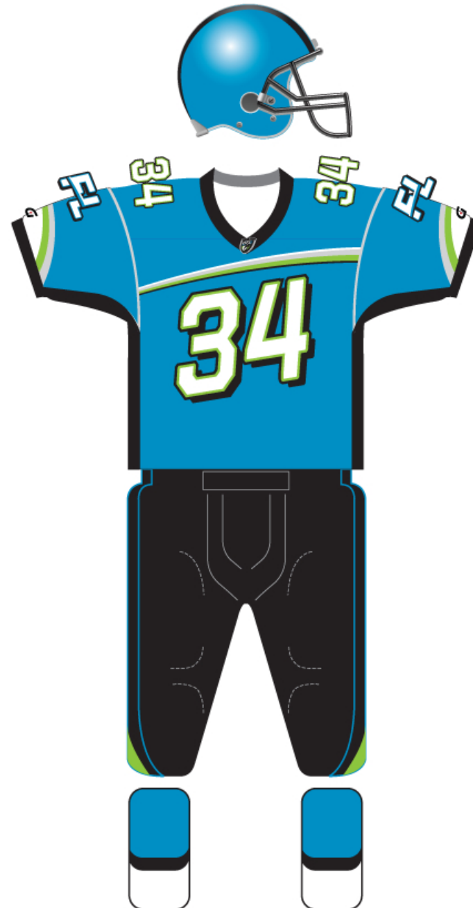
Home Uniform: Front