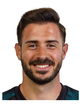
KOKE VEGAS 1 | GOALKEEPER