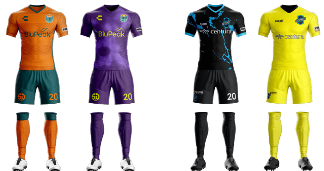
Colorado Springs Switchbacks FC