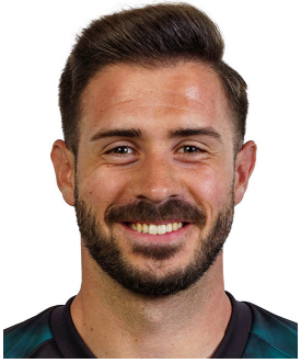
KOKE VEGAS 1 | GOALKEEPER