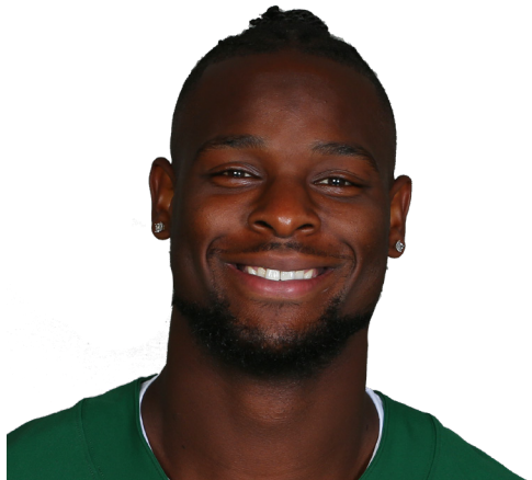
26 LE'VEON BELL