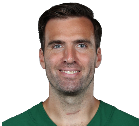
5 JOE FLACCO