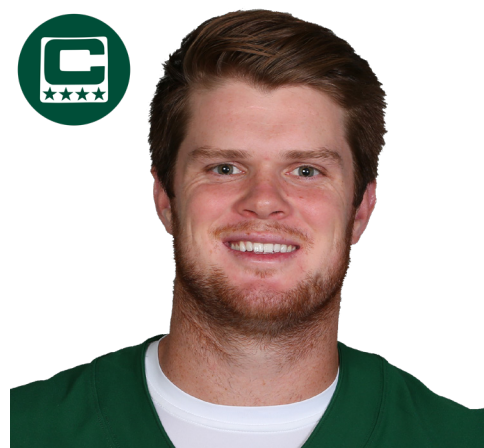
14 SAM DARNOLD