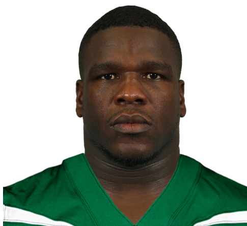
21 FRANK GORE