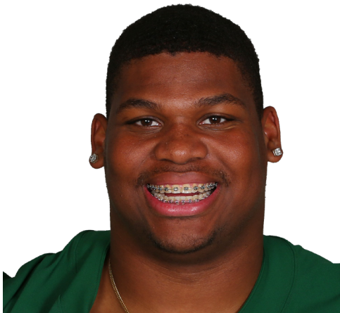
95 QUINNEN WILLIAMS