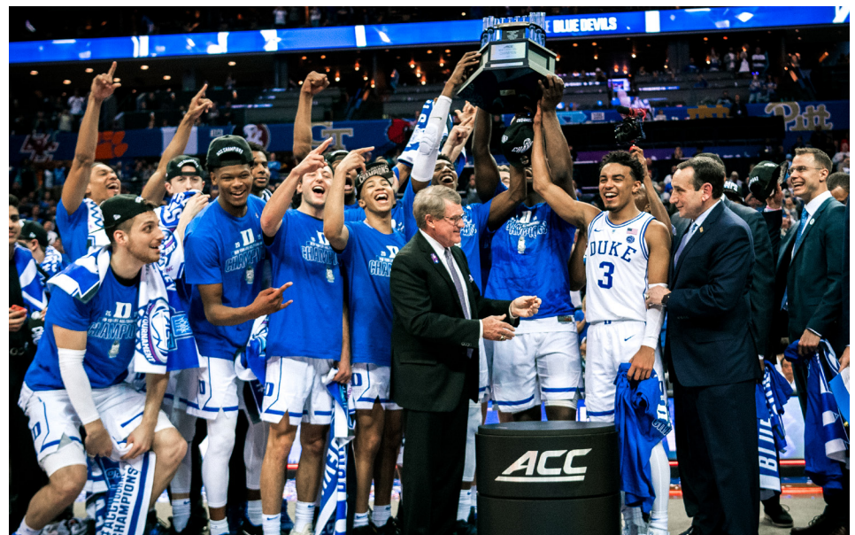
The 2019 Blue Devils, who captured the program's 21st ACC Championship, went wire-to-wire in the Associated Press top 5.