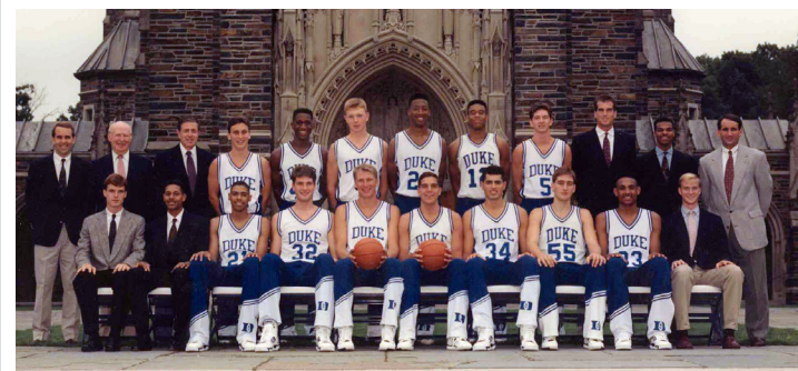
In 1992, Duke captured the school's second national championship and was ranked No. 1 in the final national Associated Press poll.