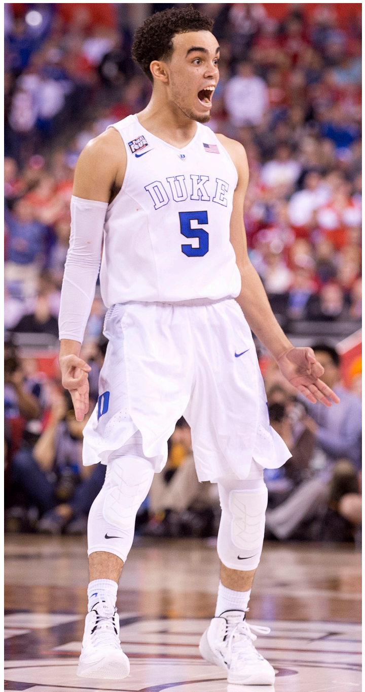
Tyus Jones earned Final Four Most Outstanding Player honors in 2015 after scoring a game-high 23 points in the championship game.