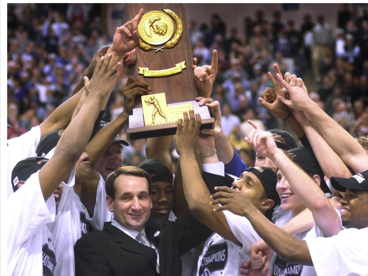
The Blue Devils were ranked No. 1 in the final national Associated Press poll in 2001. Duke went on to defeat Arizona in the NCAA championship game.