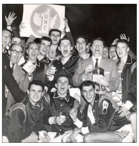
The 1957 North Carolina Tar Heels celebrate the ACC's first NCAA National Championship, defeating Kansas, 54-53, in three overtimes

University of Louisville admitted as the league's 15th member.