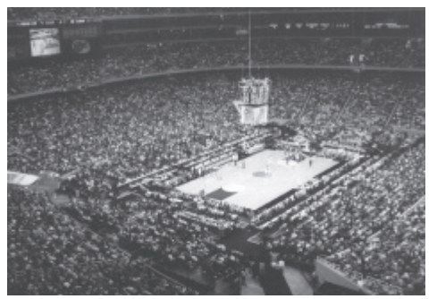
Wake Forest vs. South Carolina - 1954 First Round

All ACC Tournament games also will be available via the ESPN app