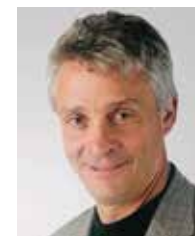
BERRY TRAMEL THE OKLAHOMAN