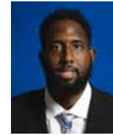
DJ WHITE VIDEO ANALYST