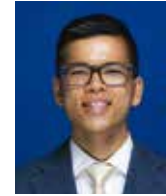
BOON PALIPATANA DATA SCIENCE & SOLUTIONS SOFTWARE DEVELOPER