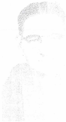
Mr. [Name] President