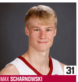
Jr. • 6-6 • 205