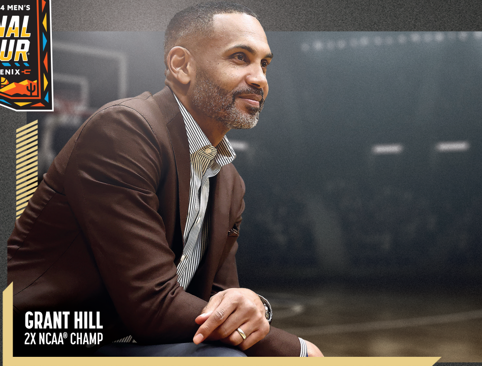
GRANT HILL 2X NCAA® CHAMP