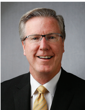
Fran McCaffery HEAD COACH