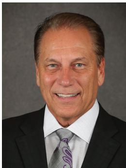
Tom Izzo HEAD COACH