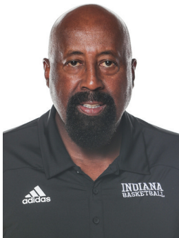
Mike Woodson HEAD COACH