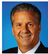
Head Coach John Calipari