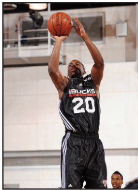
LeBron James visited UK in July (top); Jodie Meeks (bottom) led the Milwaukee Bucks in scoring during the NBA Summer League.

The two big men enlisted in a camp designed to improve basketball skills, while at the same time increasing their strength and stamina.