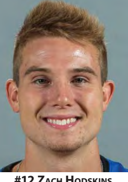
G | So. | 6-4 | 203 | Alpharetta, Ga.