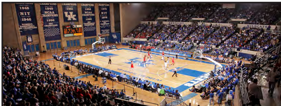
Memorial Coliseum (8,000)