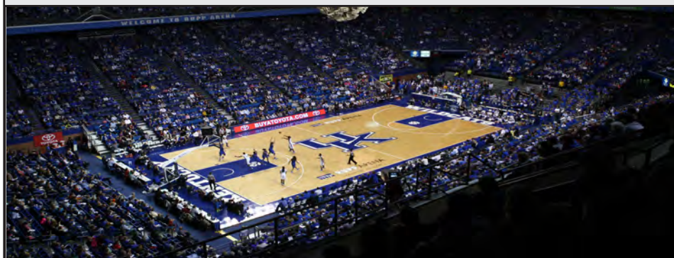
Rupp Arena (23,000)