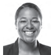
SYDNEY MYERS SPORTS MEDICINE