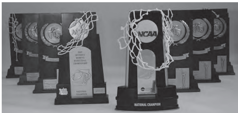
The Lady Vols are the only school to play in all 37 NCAA Women's Basketball Tournaments, advancing to 18 NCAA Final Fours and winning eight NCAA National Championships. Those titles came in 1987, 1989, 1991, 1996, 1997, 1998, 2007 and 2008.