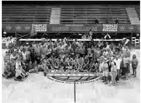
The Lady Vols and their fans celebrated after Tennessee won the Riviera Division bracket with a 3-0 record at the 2017 Cancun Challenge at the Hard Rock Hotel Riviera Maya in Puerto Aventuras, Mexico.