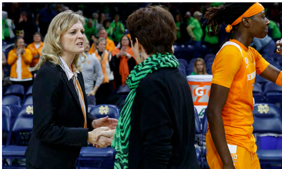
During its 7-0 start in 2019-20, Tennessee won at Notre Dame for the first time since 2008 and climbed as high as No. 17 in the AP Poll.

-- denotes no poll nr - denotes not ranked rv - denotes receiving votes