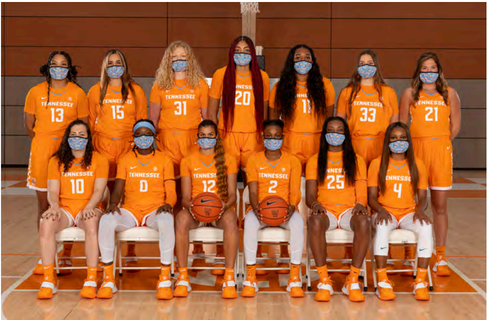
Wearing a mask became an everyday part of life in the year 2020, as the people around the world took necessary precautions to limit the contraction and spread of COVID-19.