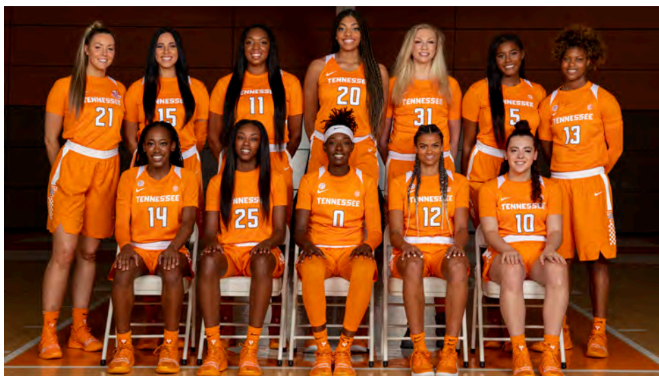
The 2019-20 Lady Vols (21-10 overall, 10-6 SEC) saw their season end prematurely due to the coronavirus (COVID-19) global health crisis.