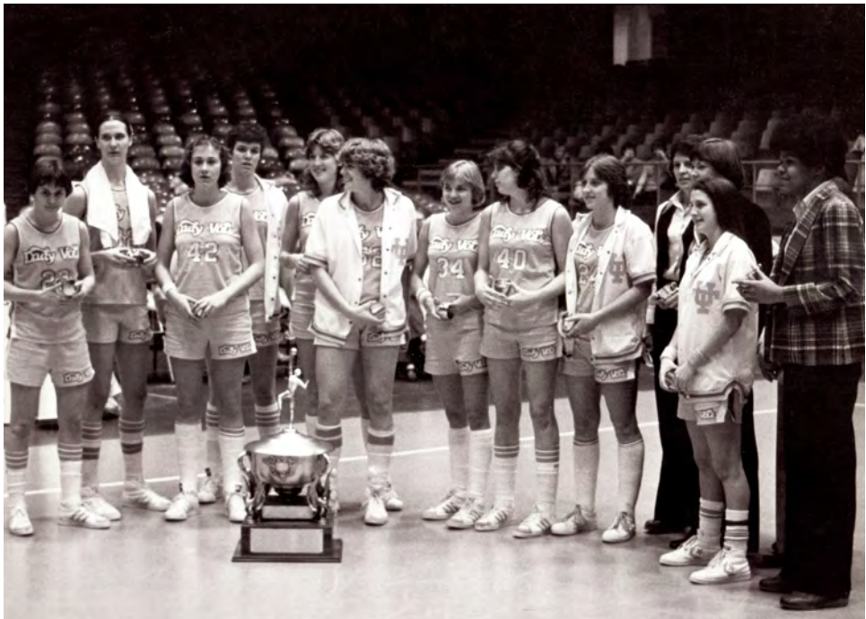
The Tennessee Lady Vols lead the SEC with 35 overall championships won, starting with the first-ever league title game contested on their home court at Stokely Athletics Center in Knoxville in 1980.