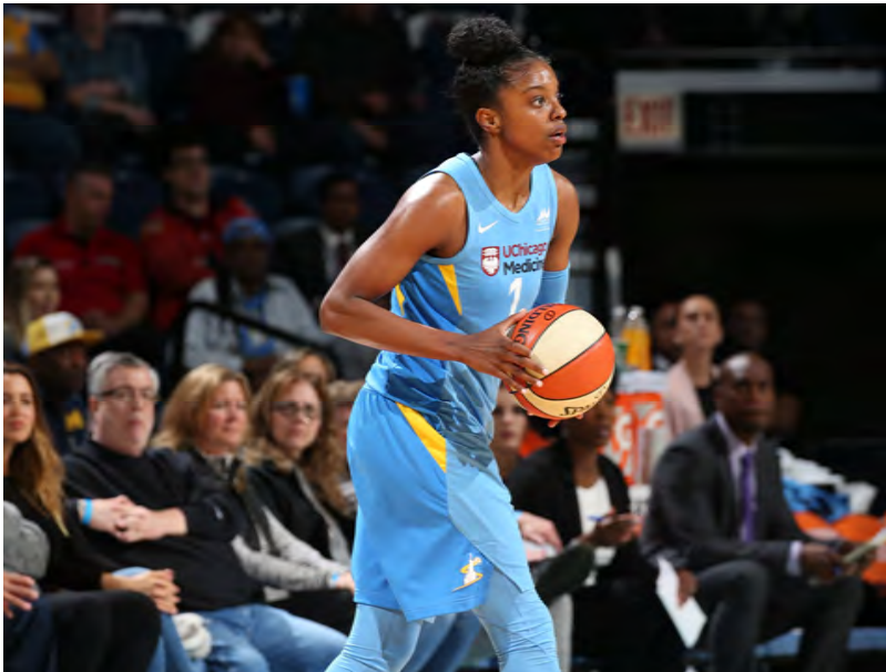
Guard Diamond DeShields, selected with the No. 3 overall pick by the Chicago Sky in 2018, was the 17th Lady Vol to be chosen in the first round of the WNBA Draft and the ninth to be among the top five overall picks.