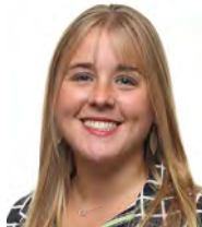
KIMBERLY HOOD MEDIA RELATIONS