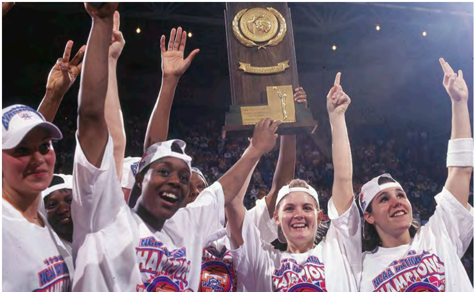
As Tennessee's point guard, Kellie (Jolly) Harper led the Lady Vols to three straight NCAA titles, including a perfect 39-0 season in 1997-98.