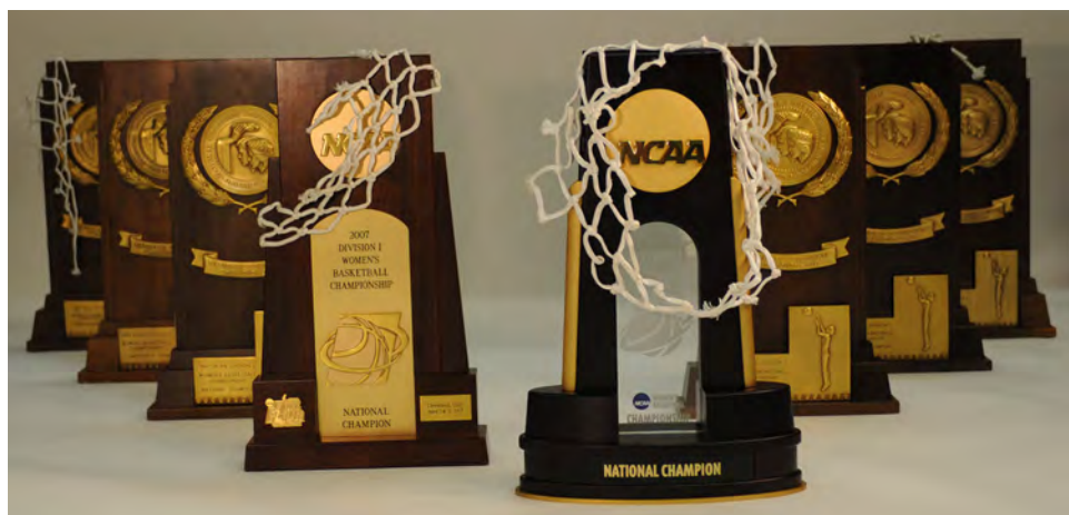
The Lady Vols are the only school to play in all 38 NCAA Women's Basketball Tournaments, advancing to 18 NCAA Final Fours and winning eight NCAA National Championships. Those titles came in 1987, 1989, 1991, 1996, 1997, 1998, 2007 and 2008.

*denotes overtime game #No tournament held in 2020 due to coronavirus (COVID-19) global health crisis