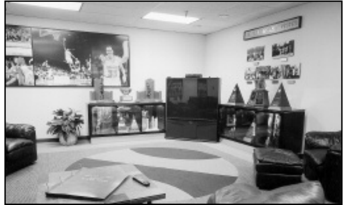
The living room area of the locker room.