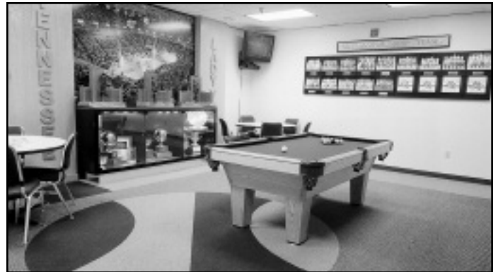
The game room is complete with pool table, video game console and a kitchen.