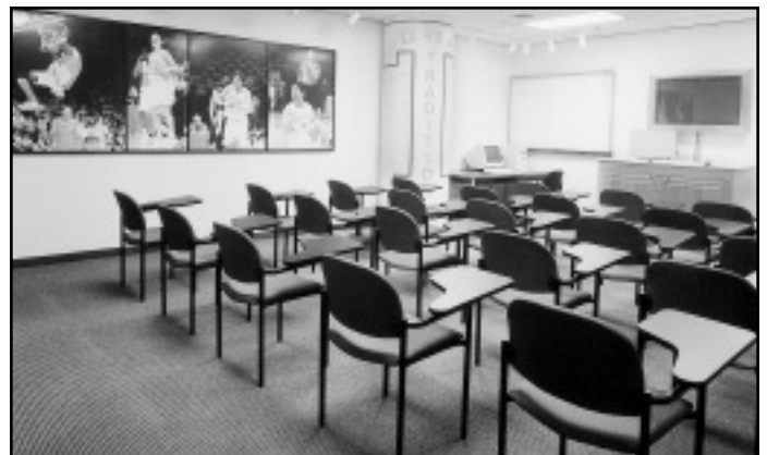
The Lady Vol video room complete with a plasma flat screen television and the Lady Vol Graduation Pole.