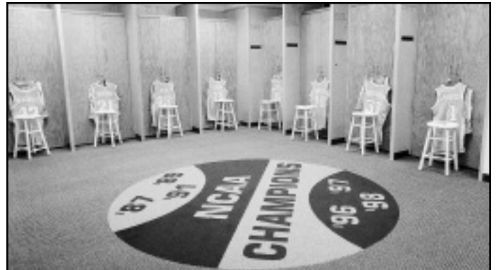
The center piece of the dressing area is a custom made NCAA Champion carpet.