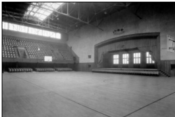
Alumni Memorial Gymnasium (1930s-1976)