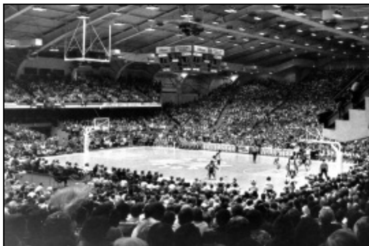
Stokely Athletics Center (1976-87)