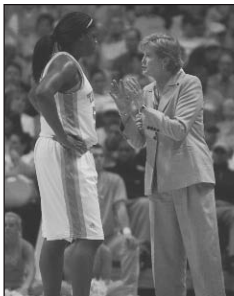
Always teaching, Coach Summitt takes advantage of a break in the action to talk things over with Nicky Anosike.

Her next international challenge was taking the U.S. National Team to the 1979 William R. Jones