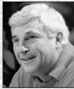
Bob Knight at INDIANA 3 Titles