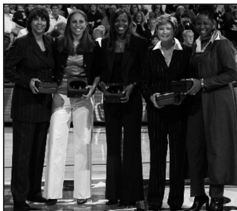
Summitt received one of the greatest honors of her coaching career when she was selected as the coach of the NCAA 25th Anniversary Team in 2006. Also named to the team were (l-r) Cheryl Miller, Diana Taurasi, Sheryl Swoopes, Pat Summitt and Bridgette Gordon (not pictured: Chamique Holdsclaw).

By the time Summitt graduated from UT-Martin in 1974, she symbolized the prototype player of the decades to come. She was strong ... had great instincts ... was awesome on defense ... took a charge like a greedy housewife ... denied the ball all over the court ... rebounded with authority ... took the ball to the hoop ... and then could knock the lights out over a zone defense.