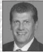
Geno Auriemma at CONNECTICUT 5 Titles