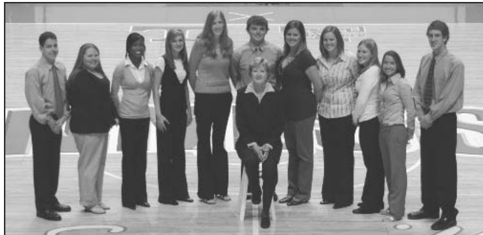
The 2006-07 women's basketball managers with head coach Pat Summitt.