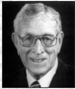
John Wooden at UCLA 10 Titles