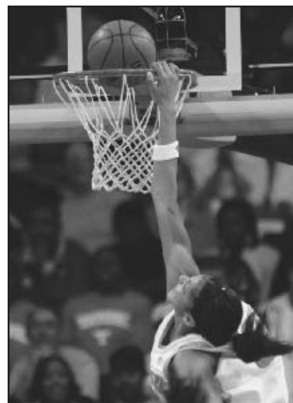
Candace Parker became the first female to dunk in an NCAA Tournament game when she threw down twice against Army in the opening round of the 2006 tournament.

PAT SUMMITT LEADS IN NCAA GAMES COACHED — Summitt has coached in 111 NCAA Tournament games -- her record in the NCAA Tournament is now 92-19 (.833).