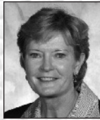
Pat Summitt at TENNESSEE 6 Titles