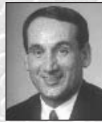
Mike Krzyzewski at DUKE 3 Titles

Cup Games, the 1979 World Championships and the 1979 Pan American Games. Summitt and her team returned home with two gold medals and one silver medal.