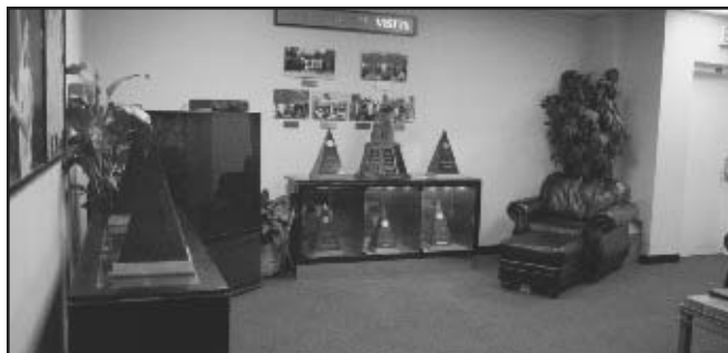
Television, trophies and photos of White House visits in the Lady Vol living room.