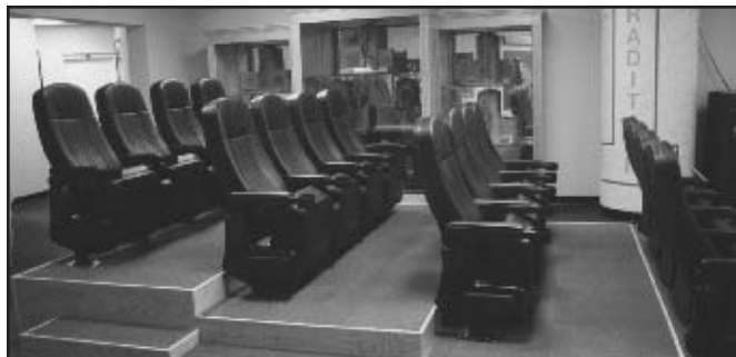
The Lady Vol video room has stadium seating for better viewing. On display in the video room are recent trophies and the graduation pole.