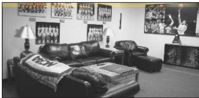
Plush leather couches in the Lady Vol living room... comfortable for studying or napping!

Hundreds of collegiate coaches and fans took a tour through the locker room during the Final Four in 1990. Their interest was piqued due to Coach Summitt's eviction of the Lady Vols from their plush pad after a dismal 1989 road swing through California. The story landed on the front page of the USA TODAY sports section and was the topic of conversation with the media for the month the team was kept out of the locker room. Said junior pivot Carla McGhee at the time, "It was like we didn't pay our rent by playing hard and she evicted us."