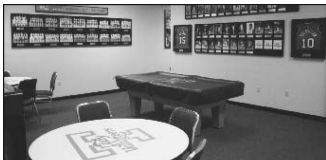
The game room is complete with pool table, video console and a kitchen.