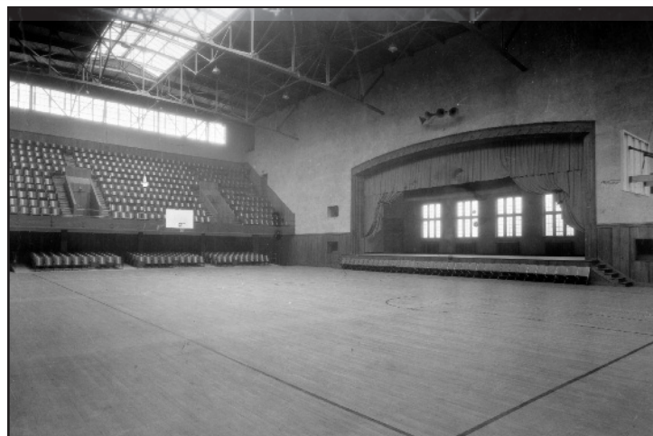
Alumni Memorial Gymnasium (1930s-1976)