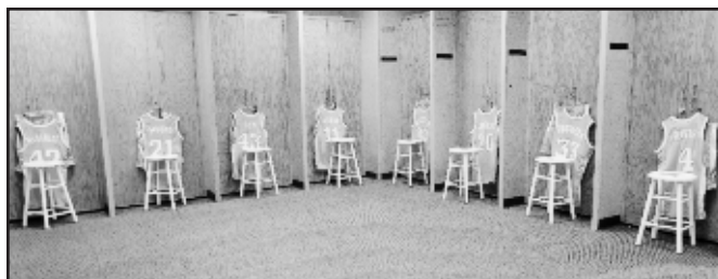
The Lady Vol dressing room.