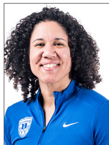
KARA LAWSON Head Coach Tennessee '03 3rd Season at Duke 3rd Season Overall