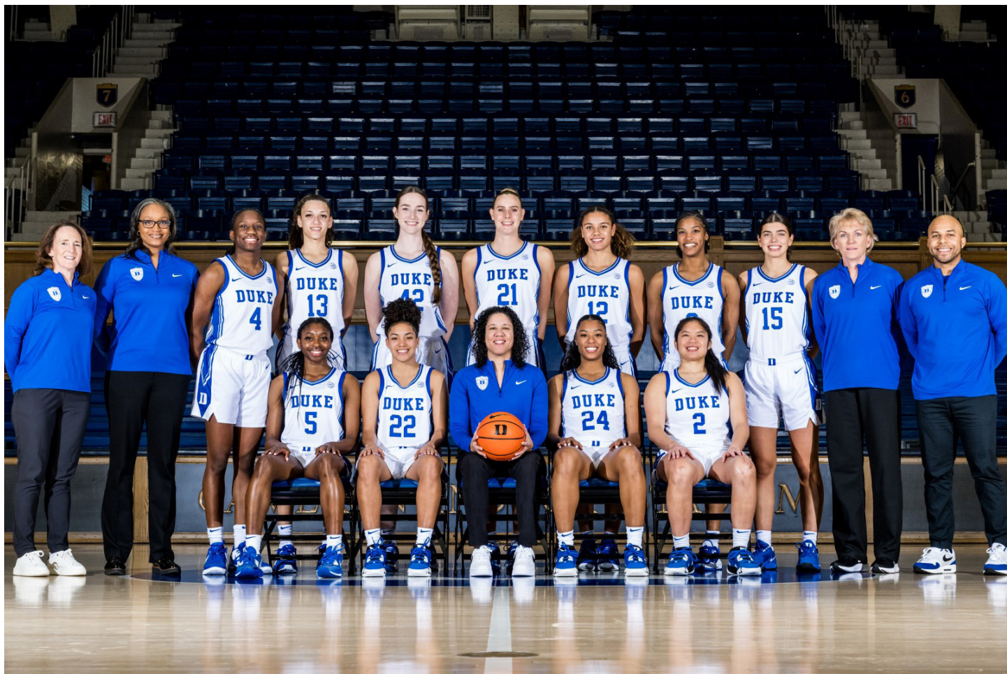
2023-24 DUKE UNIVERSITY BLUE DEVILS