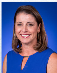
Joanne P. McCallie Head Coach 12th Season at Duke