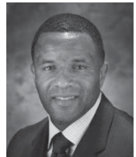
DAMON STOUDAMIRE Assistant Coach First Season