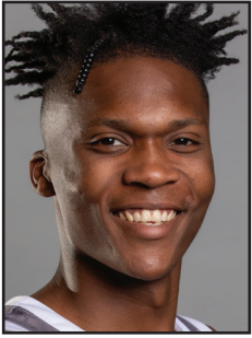
#0 Benedict Mathurin G/F - 6-7 - 195 - Fr. Montreal, Canada IG: @realbm11