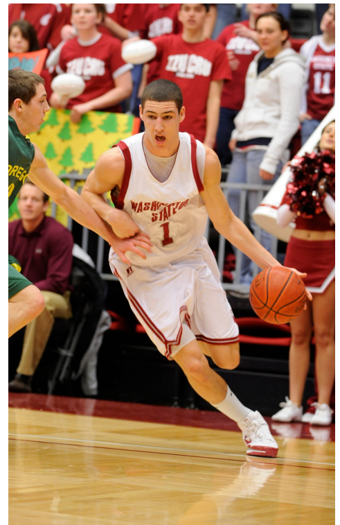
Klay Thompson, Washington State