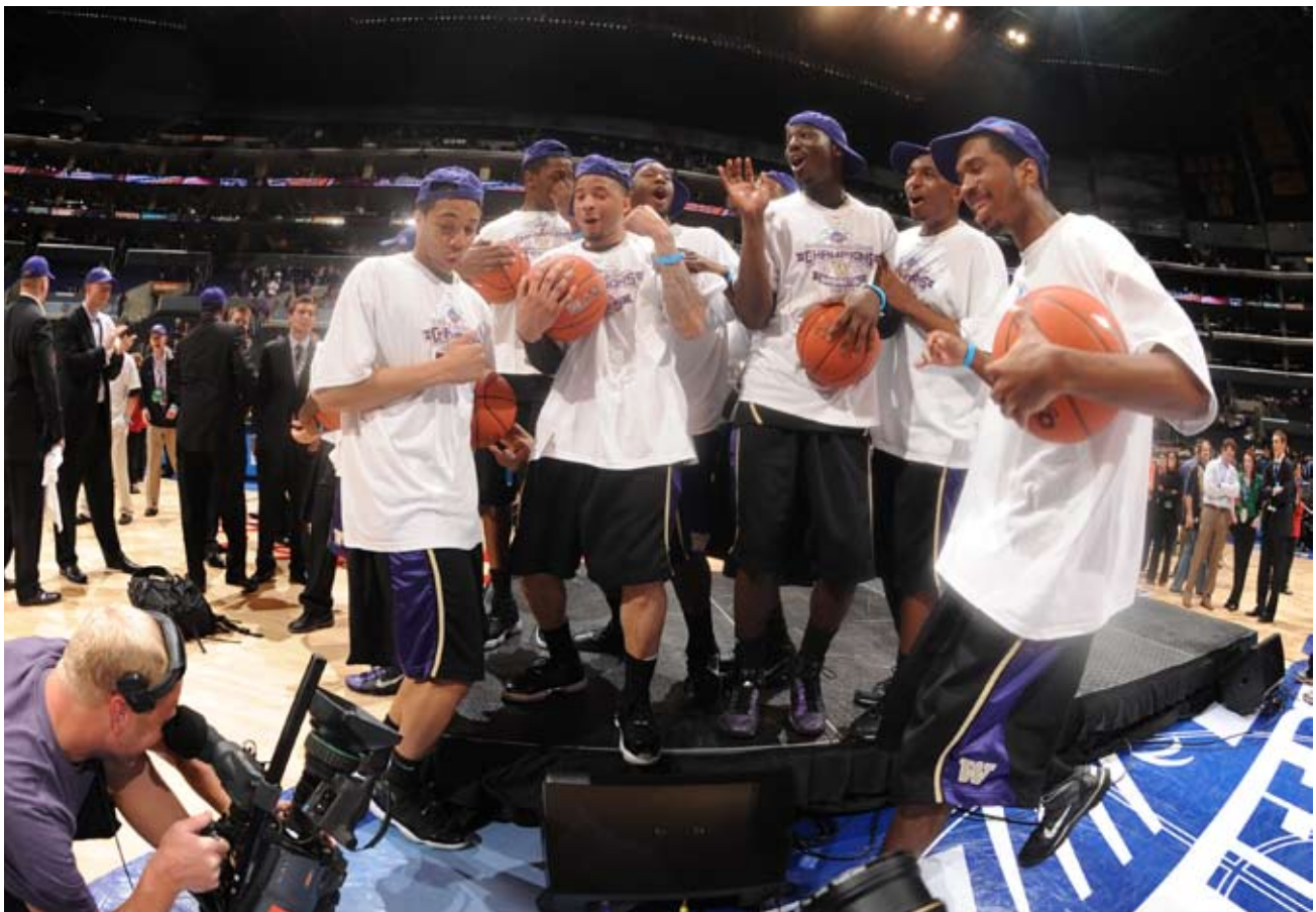
WASHINGTON - 2010 Pacific Life Pac-10 Tournaments