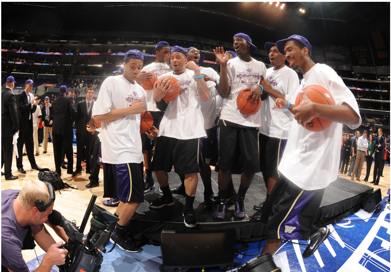
WASHINGTON - 2011 Pacific Life Pac-10 Tournament Champions