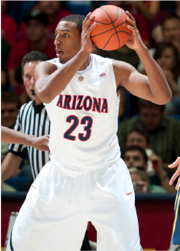
Derrick Williams – Pac-10 Player of the Year