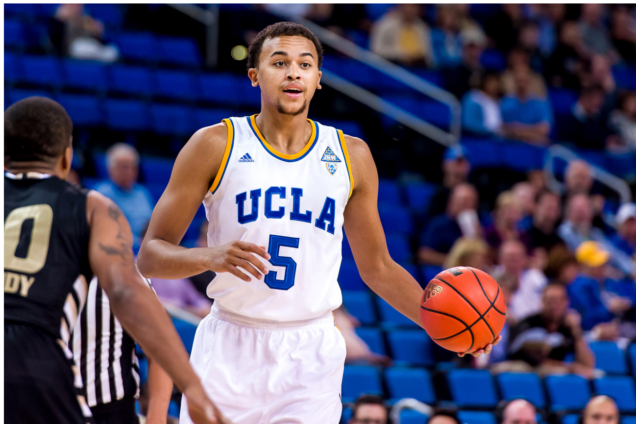
UCLA's Kyle Anderson, the Pac-12 Tournament Most Outstanding Player

Aaron Gordon, Arizona Nick Johnson, Arizona Askia Booker, Colorado Joe Young, Oregon Chasson Randle, Stanford Kyle Anderson, UCLA - Most Outstanding Player