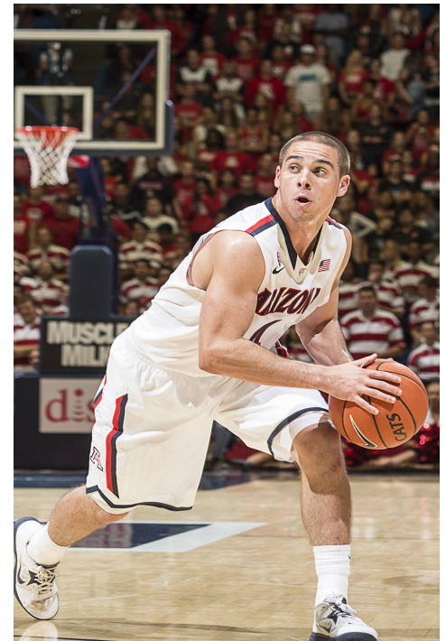
T.J. McConnell, Arizona

Get Your Picture Taken With Adam Silver... With Arizona's Aaron Gordon selected fourth overall in the NBA Draft, the Pac-12 now has now had a player selected in the first round in the NBA Draft for the 26th consecutive year... UCLA had three players selected in the first round - Zach LaVine, Jordan Adams and Kyle Anderson. It's happened once before in the Conference with UCLA's Dave Greenwood, Roy Hamilton and Brad Holland all taken within the first 14 picks of the 1979 NBA Draft... The league has had 29 first-round picks over the last seven years of the NBA Draft. Over the last seven NBA Drafts, a total of 48 Pac-12 players have been selected representing 11 of the Conference's 12 member institutions.