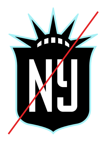
Do not change any colors in the logo.