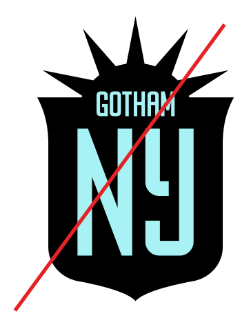
Do not add or remove any elements of the logo.