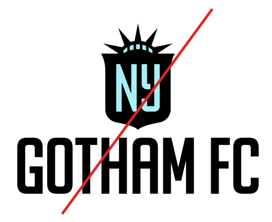
Do not alter the scale, positioning, or alignment in the wordmark lockups.