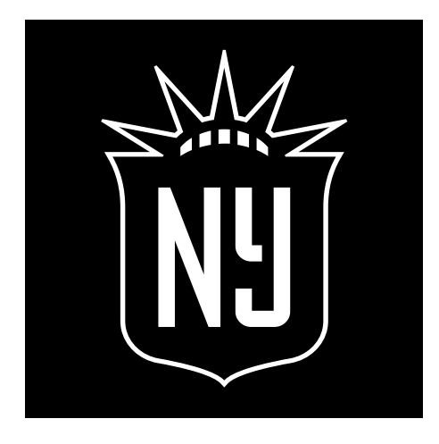
Single color, white