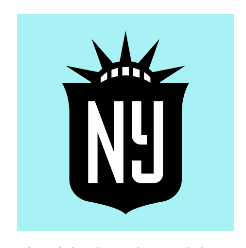
Solid, black + white