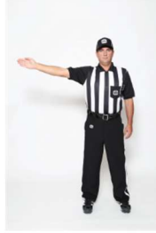
ONSIDE OR LATERAL PASS pointing in the direction the ball was thrown