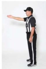
FIRST DOWN AWARDED arm pointed forward