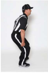
CLIPPING striking back of knees