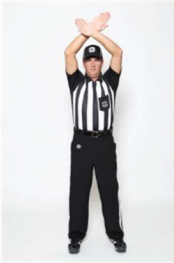
TIME OUT hands crossed above head