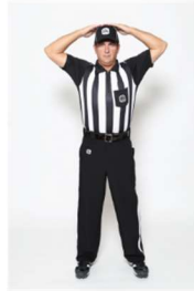
TOO MANY PLAYERS both hands on top of head