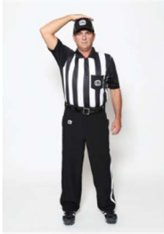
ILLEGAL SUBSTITUTION one hand on top of head