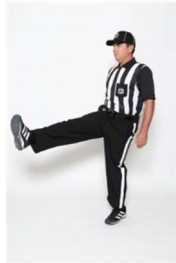
ROUGHING THE KICKER kicking motion