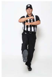
ILLEGAL KICKOFF hands rolling in forward motion followed by swinging leg