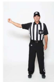
UNNECESSARY ROUGHNESS pumping motion of arms sideways