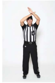
SPEARING chopping motion above head