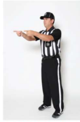
COIN TOSS WINNER pointing with both arms towards the team that won the toss