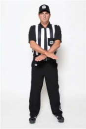
PENALTY DECLINED swinging arms at hip level