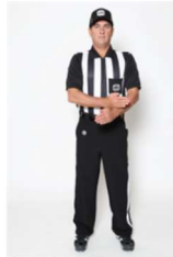
DISQUALIFICATION chopping action on wrist