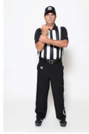
HOLDING grasping wrist at chest level