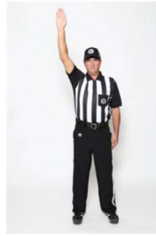
TIME IN downward rotation of arm