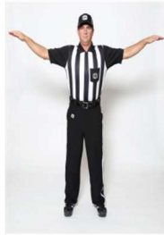
INELIGIBLE RECEIVER both arms extended sideways