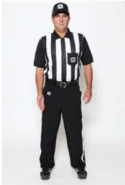
ILLEGAL CRACKBACK striking thigh with open hand