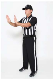
ILLEGAL INTERFERENCE pushing arms forward from shoulders