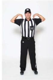
ILLEGALLY DOWNFIELD ON A KICK both hands on top of shoulders