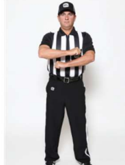
ILLEGAL PROCEDURE hands rotating in forward motion