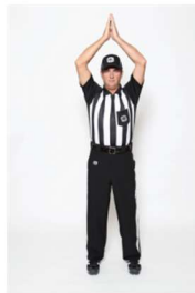
SAFETY TOUCH palms together above head