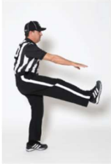
CONTACTING THE KICKER touch raised leg below knee