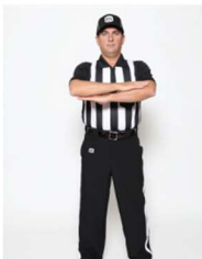
NO YARDS arms folded at chest