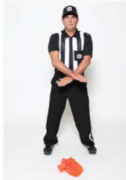
NO FLAG ON PLAY drop flag on ground & swing arms at hip level