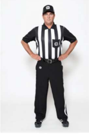
OFFSIDE hands on hips