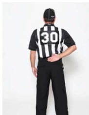
OBJECTIONABLE CONDUCT One hand behind back