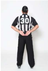
DELAY OF GAME both hands behind back