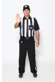
ILLEGAL CONTACT ON A RECEIVER one arm extended with open hand