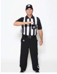
ILLEGAL PASS horizontal arc of arm