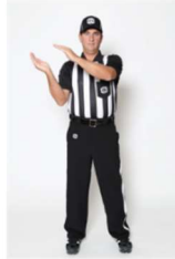
CUT OR CHOP BLOCK horizontal chopping motion