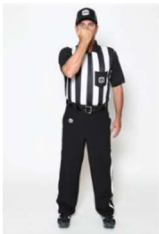
FACEMASK clenched fist at face level