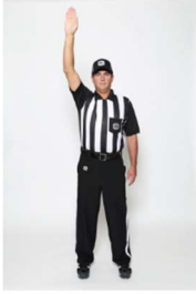
FORWARD PASS BEHIND LINE OF SCRIMMAGE raise arm above head