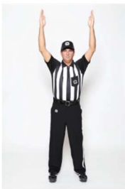
TOUCHDOWN OR FIELD GOAL both arms raised towards sky