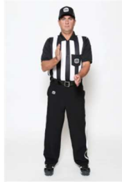
PILING ON vertical chopping motion with both hands