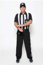
RESETTING THE 20 - SECOND CLOCK a stroking motion of the forearm