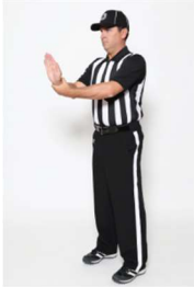
ILLEGAL BLOCK arm extended & grasp wrist