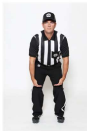
TRIPPING chopping action on both knees