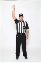
SINGLE POINT one arm extended above head & indicating 1 point