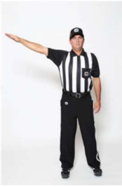
TIME COUNT VIOLATION arm extended moving in circular motion