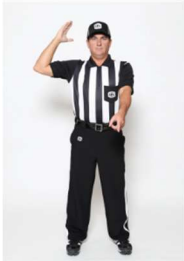
INTENTIONAL GROUNDING passing motion & pointing at ground