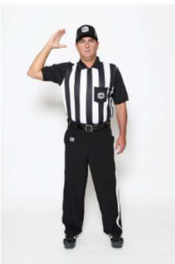
ROUGHING THE PASSER passing motion