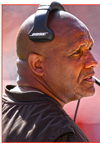
HC | HUE JACKSON

Hue Jackson: 10-40-1, fourth season as a head coach, third with the Browns. Hue Jackson was named the 16th full-time head coach in Cleveland Browns history on Jan. 13, 2016. He's in the midst of his 32nd year as a coach, with the last 18 being in the NFL. He's spent 11 seasons coaching in the AFC North, helping his team advance to the postseason seven times in that span. Jackson was also head coach of the Oakland Raiders in 2011 and guided the team to an 8-8 record. He's also served as offensive coordinator with the Washington Redskins (2003), Atlanta Falcons (2007), Raiders (2010) and Cincinnati Bengals (2014-15). He spent 14 years coaching on the collegiate level and was a QB at Pacific from 1985-86.