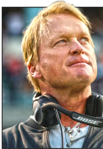
HC | JON GRUDEN