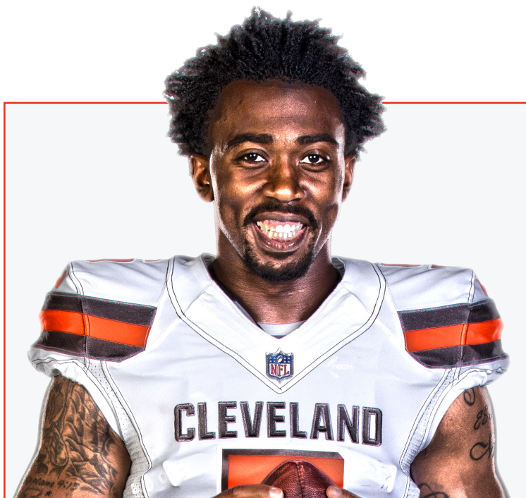
QB | 5 TYROD TAYLOR

Cleveland Browns at Oakland Raiders | Regular Season Week 4, Game 4