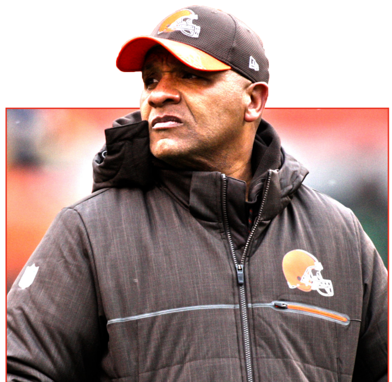
HC | HUE JACKSON

After spending the 2010 season as the Raiders offensive coordinator, Jackson was promoted to head coach in 2011.