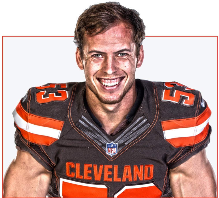
LB | 53 JOE SCHOBERT

With an interception and two fumble recoveries, LB Joe Schobert has already established a new career high with three total takeaways. His three takeaways, along with teammate rookie DB Denzel Ward (two interceptions, one fumble recovery), tie for the most in the NFL and are also tied for the most among all LBs.