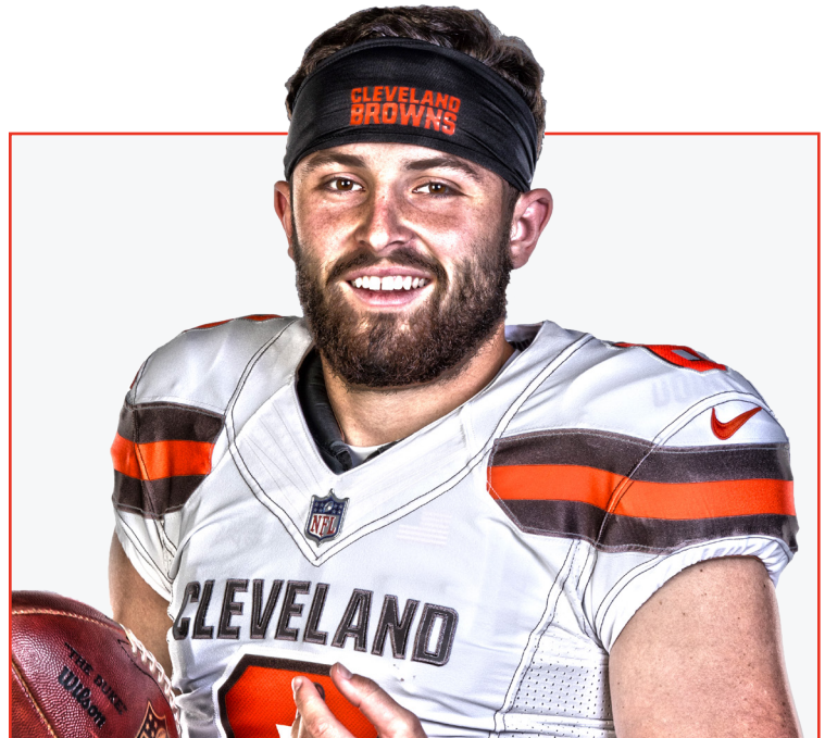
QB | 6 BAKER MAYFIELD