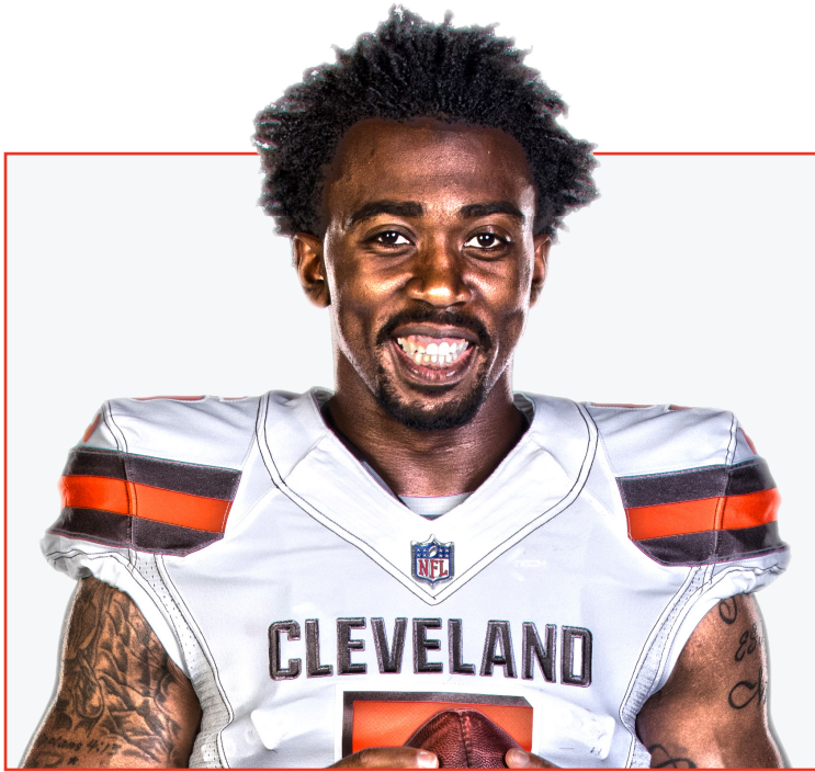
QB | 5 TYROD TAYLOR

Two-time Pro Bowl QB Tyrod Taylor has 1,700 rushing yards since 2015, which is second best among all NFL QBs during that span and is the most in the AFC. For his career, Taylor has carried the ball for 1,788 yards and ranks ninth among AFC QBs on the NFL's all-time rushing yards list.