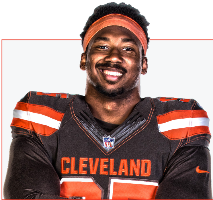
DL | 95 MYLES GARRETT