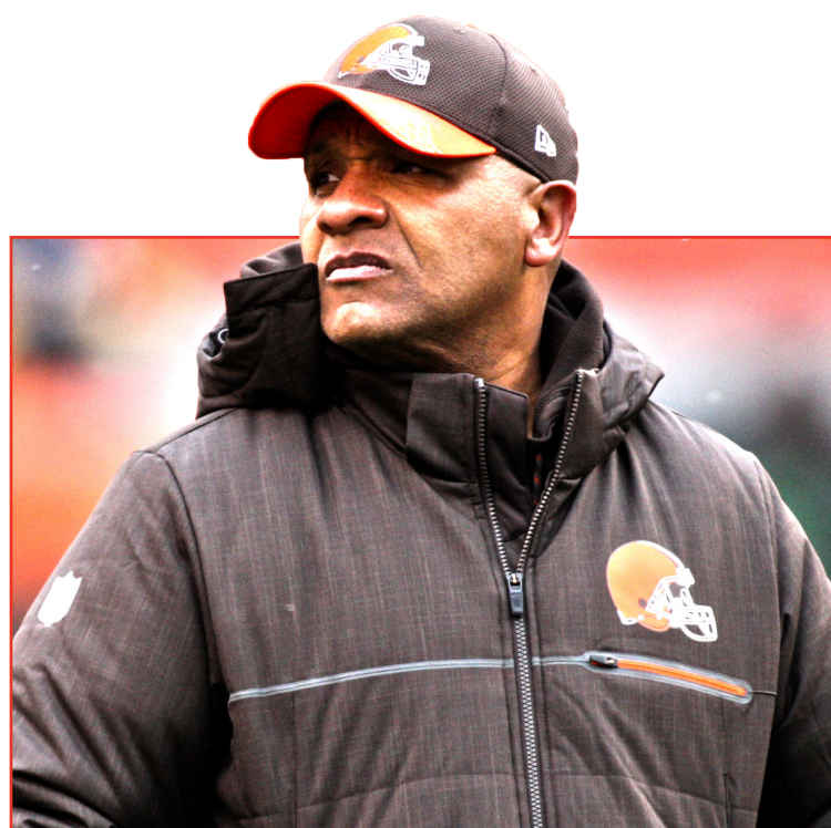
HC | HUE JACKSON

After spending the 2010 season as the Raiders offensive coordinator, Jackson was promoted to head coach in 2011. Oakland finished the year 8-8 and tied for first in the AFC West