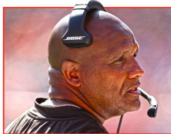
HC | HUE JACKSON