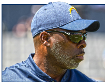
HC | ANTHONY LYNN L.A. Chargers