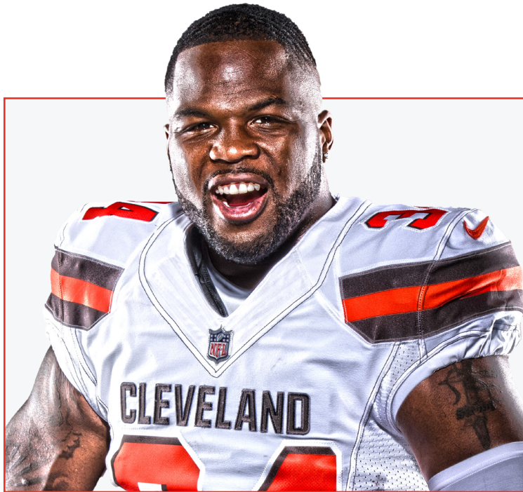
RB | 34 CARLOS HYDE

RB Carlos Hyde 's career-high eight rushing scores in 2017 tied for sixth in the NFL and the fourth in the NFC. It marked the first season in which Hyde finished among league leaders (top 10) in rushing touchdowns. Hyde is tied for fourth in the category since last year.