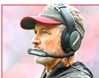
HC | DIRK KOETTER Buccaneers.com