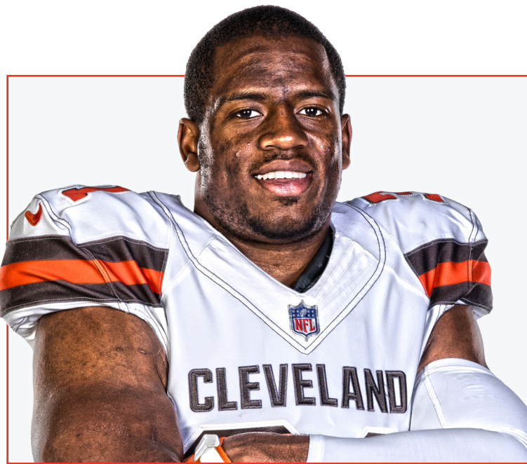
RB | 24 NICK CHUBB