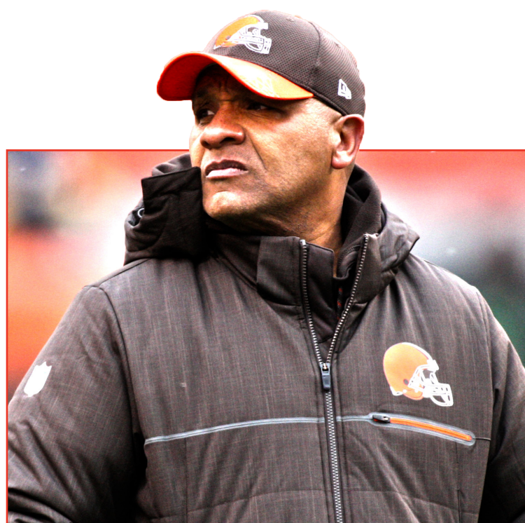
HC | HUE JACKSON

After spending the 2010 season as the Raiders offensive coordinator, Jackson was promoted to head coach in 2011. Oakland finished the year 8-8 and tied for first in the AFC West