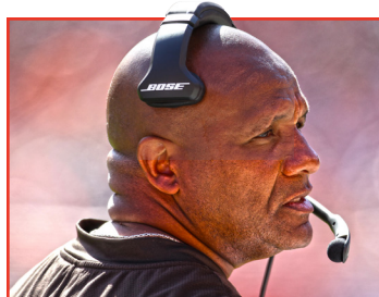
HC | HUE JACKSON