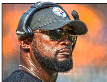
HC | MIKE TOMLIN