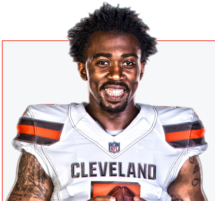
QB | 5 TYROD TAYLOR

Two-time Pro Bowl QB Tyrod Taylor has 1,700 rushing yards since 2015, which is second best among all NFL QBs during that span and is the most in the AFC. For his career, Taylor has carried the ball for 1,788 yards and ranks ninth among AFC QBs on the NFL's all-time rushing yards list.