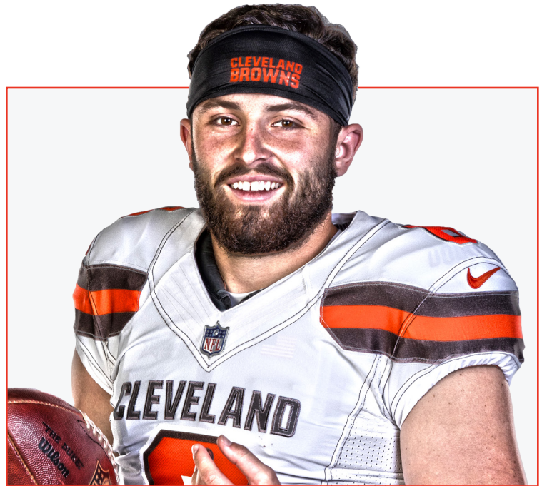
QB | 6 BAKER MAYFIELD

His four games are already the most by a Brown in his first two NFL seasons.