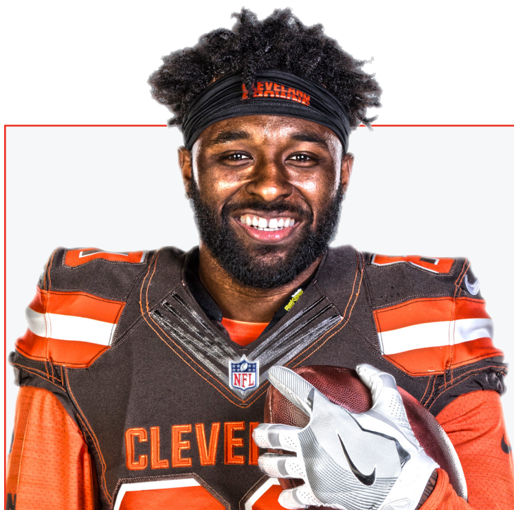
WR | 80 JARVIS LANDRY

WR Jarvis Landry finished 2017 with a league-best 112 receptions for 987 yards and a career-best nine touchdowns. Not only did his number of receptions pace the NFL, but it was the best in the league since 2015 and marked a new career high. Since last year, Landry is third among all NFL receivers in receptions (153).