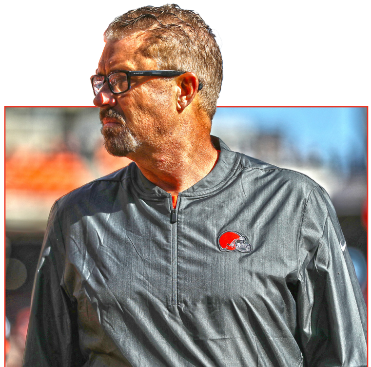
HC | GREGG WILLIAMS

He spent one season (2008) with Jacksonville as defensive coordinator/assistant head coach following four seasons (2004-07) as assistant head coach/defense with Washington. The Redskins had one of the NFL's top defenses over that span, allowing just 19.4 points per game and ranking sixth overall in defense during the four-season stretch. In 2005, the Redskins' defense was a key factor in the club making its first postseason appearance since 1999.