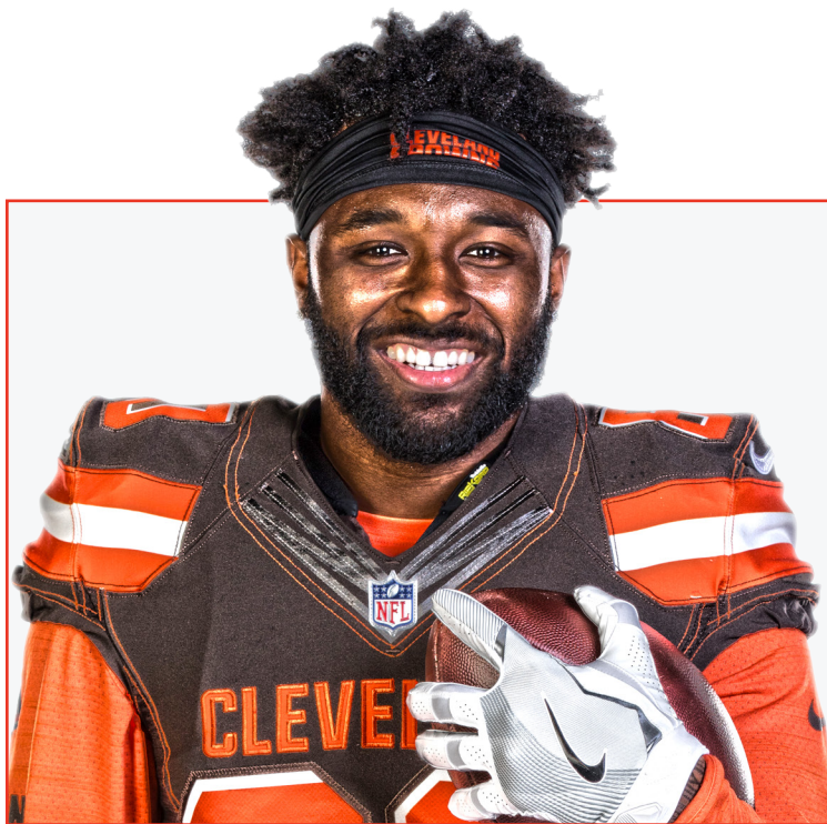
WR | 80 JARVIS LANDRY

WR Jarvis Landry finished 2017 with a league-best 112 receptions for 987 yards and a career-best nine touchdowns. Not only did his number of receptions pace the NFL, but it was the best in the league since 2015 and marked a new career high. Since last year, Landry is third among all NFL receivers in receptions (169).