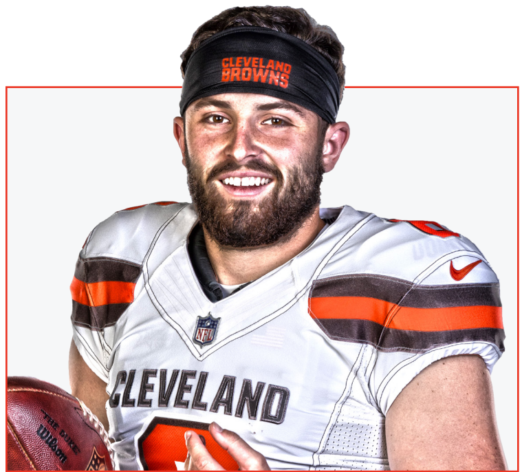
QB | 6 BAKER MAYFIELD

His four games are already the most by a Brown in his first two NFL seasons.