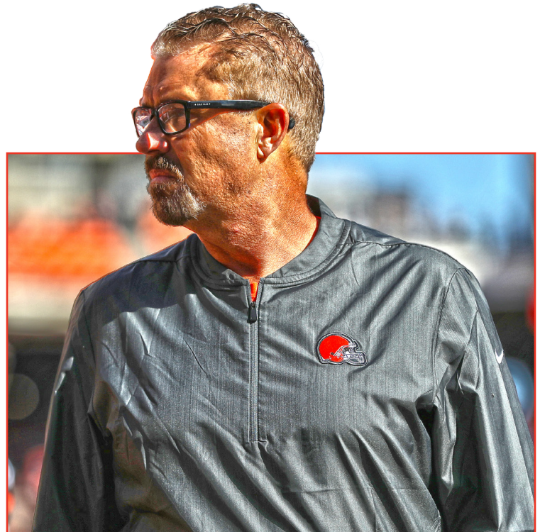
HC | GREGG WILLIAMS

He spent one season (2008) with Jacksonville as defensive coordinator/assistant head coach following four seasons (2004-07) as assistant head coach/defense with Washington. The Redskins had one of the NFL's top defenses over that span, allowing just 19.4 points per game and ranking sixth overall in defense during the four-season stretch. In 2005, the Redskins' defense was a key factor in the club making its first postseason appearance since 1999.