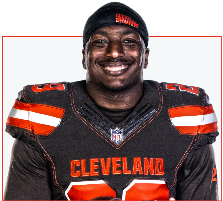
RB | 29 DUKE JOHNSON JR.

RB Duke Johnson Jr. finished third among NFL RBs last season in scrimmage yards per touch with a 6.7 average. It marked the second consecutive season he's finished top-three in the league after putting up the best average (6.9) in 2016. Since entering the league in 2015, Johnson Jr.'s 6.5 scrimmage yards per touch average is the league's fourth-best mark among all RBs.