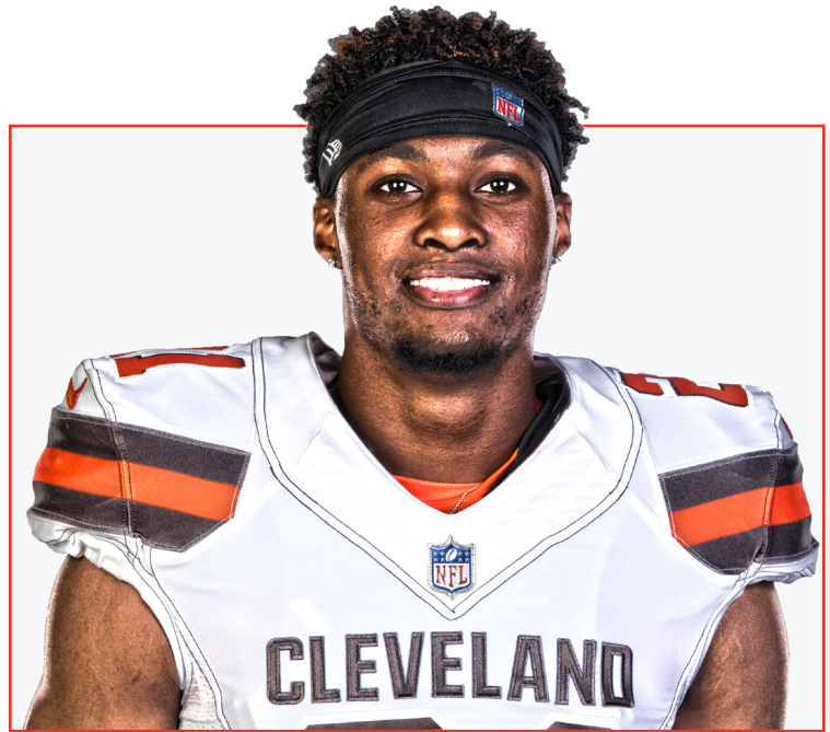
DB | 21 DENZEL WARD

In the AFC, Randall's four interceptions this season currently tie for second, while they rank tied for sixth in the NFL. Randall is the first Brown to pick off a QB at least four times in a season since 2014.