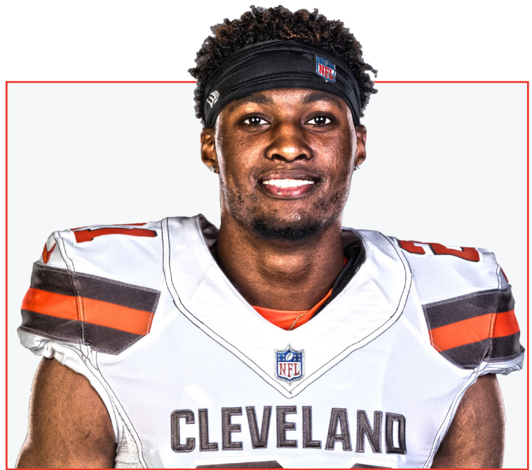
DB | 21 DENZEL WARD

In the AFC, Randall's four interceptions this season currently tie for second, while they rank tied for sixth in the NFL. Randall is the first Brown to pick off a QB at least four times in a season since 2014.