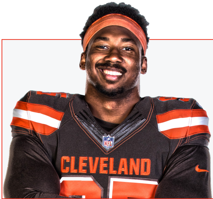
DL | 95 MYLES GARRETT