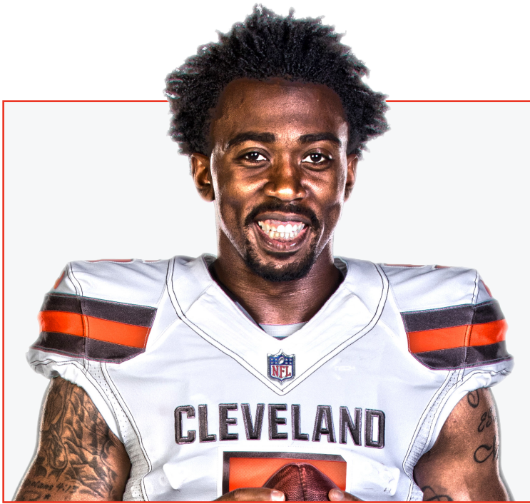
QB | 5 TYROD TAYLOR

Two-time Pro Bowl QB Tyrod Taylor has 1,700 rushing yards since 2015, which is third best among all NFL QBs during that span and is the most in the AFC. For his career, Taylor has carried the ball for 1,788 yards and ranks ninth among AFC QBs on the NFL's all-time rushing yards list.