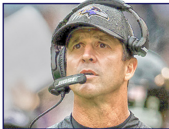
HC | JOHN HARBAUGH