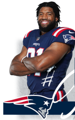
DEATRICH WISE JR.