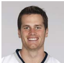
QB TOM BRADY Second Selection