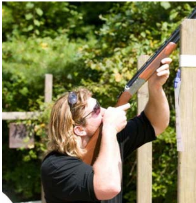
Matt Light takes aim at a sporting clay during his 2007 Matt Light Foundation Celebrity Shoot-Out.

New England Patriots offensive lineman Matt Light hosted his third annual Celebrity Shoot-Out, a clay-shooting event to benefit the Matt Light Foundation on August 31 at Addieville East Farm in Mapleville, R.I.